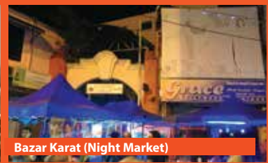
Bazar Karat (Night Market)