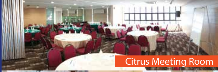
Citrus Meeting Room