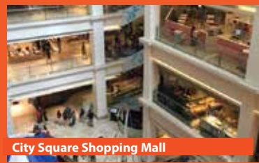
City Square Shopping Mall