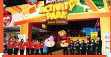
Angry Bird Indoor Theme Park at JBCC