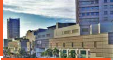
JB City Centre Mall (JBCC)